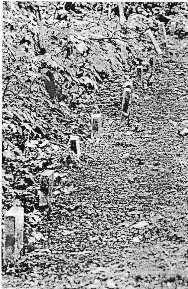
FIELD OF THE FORGOTTEN: Potter's Field in Smithtown lies just off of Darling Avenue. There are about 42 people buried there.