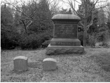
Mathews Gravesite