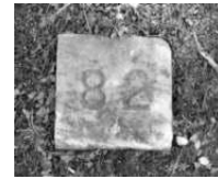
Northeast corner and 'Poor Gravesite & 'number' stone.

UNFORTUNATE, RECORDS WERE NOT KEPT COMPLETELY OR YET FOUND FOR THE 'POOR' AREA. LISTED ARE SOME DATES THAT HAVE BEEN RECORDED FOR 'UNKNOWN' PERSONS FOUND: DROWN OR FOUND ON THE SHORE, MOSTLY MALES: 5 LISTED FOR 1903, 2 LISTED FOR 1907, 1 LISTED FOR 1911, 1 LISTED FOR 1912, 1 LISTED FOR 1917, 1 LISTED FOR 1918, 1 LISTED FOR 1919, 1 LISTED FOR 1925 [FEMALE], 1 LISTED FOR 1928, 2 LISTED FOR 1930, 1 LISTED FOR 1931.