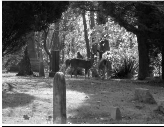
A DEER HERD AT CEDAR HILL CEMETERY, PORT JEFFERSON, NEW YORK