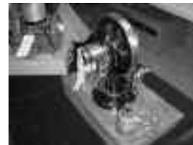
The Allman Gas Engine

ISAAC F. ALLMAN (1842-1910), WAS ATTACHED TO THE 13 th NEW YORK CAVALRY DURING CIVIL WAR AS A CORPORAL. HE WAS PART OF THE 'GREAT REBELLION' FOR FOUR YEARS. HE WAS IN COMMAND FOR THE RETURN MARCH HOME, AS HIS OFFICERS WERE LYING DEAD ON THE BATTLEFIELD. HE WAS INVENTOR AND PERFECTED THE 'ALLMAN GAS ENGINE', WHICH WAS USED, IN THE MECHANICAL REFRIGERATION INDUSTRY, NOT IN TRANSPORTATION. THE ENGINE WAS PATENTED IN 1891. THE ALLMAN GAS ENGINE COMPANY WAS AT 461 CANAL ST. N.Y.C., ESTABLISHED IN 1897. TODAY, MODELS OF THE ALLMAN ENGINE SELL FOR $1,600. HE IS IN SECTION: H SITE: 109. {Photo of the Allman Gas Engine, Bruce Maxwell Collection, Internet Resource} (Port Jefferson Echo newsprint)